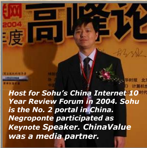
Host for Sohu’s China Internet 10 Year Review Forum in 2004. Sohu is the No. 2 portal in China. Negroponte participated as Keynote Speaker. ChinaValue was a media partner.